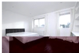
Photo coming soon